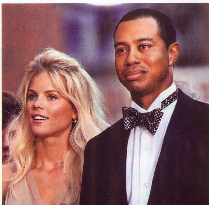
"I married Elin because I see a long future with her," says Woods (with her in September).

I'd like to have a boy first, then a girl. I like the idea of a big brother taking care of his little sister. I want them to be close in age too. I want my kids to grow up close.